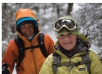
Okemo Moonlight Snowshoe Hike Sat Dec 10, 2016