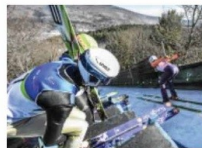
Harris Hill Ski Jump Pepsi Challenge Sat Feb 18, 2017