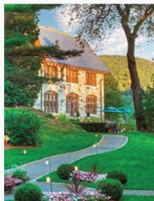
TRENDING LOCALLY Local Resorts